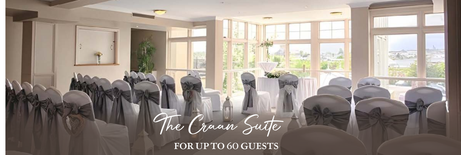
The Craan Suite FOR UP TO 60 GUESTS