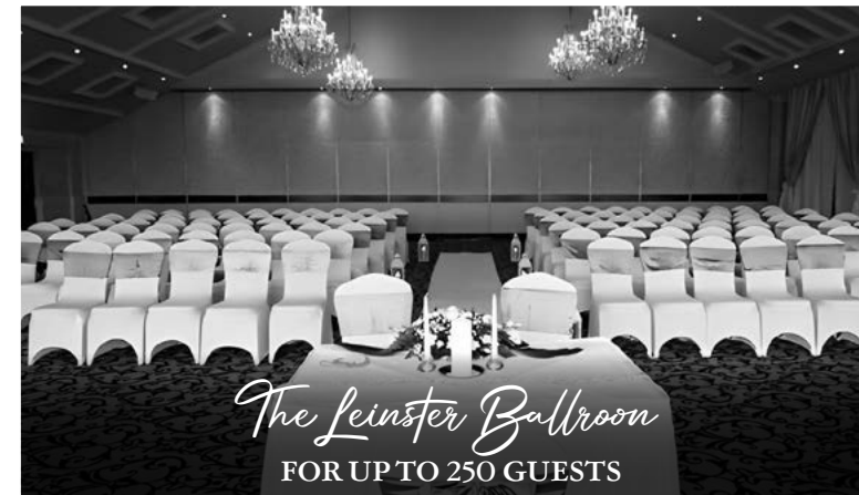
The Leinster Ballroom FOR UP TO 250 GUESTS