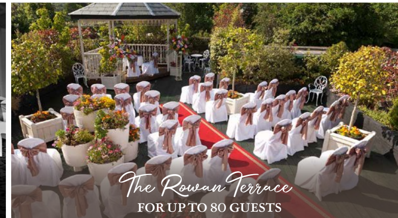
The Rowan Terrace FOR UP TO 80 GUESTS